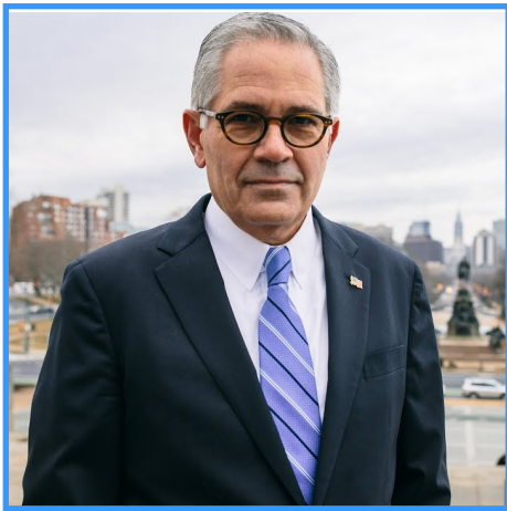
Larry Krasner District Attorney City of Philadelphia

A lifelong commitment to accuracy in criminal justice, civil rights, equal justice, and empowering the people.